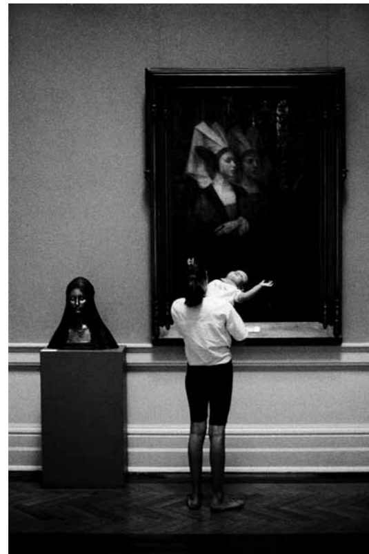
Great joy – Art Gallery of New South Wales