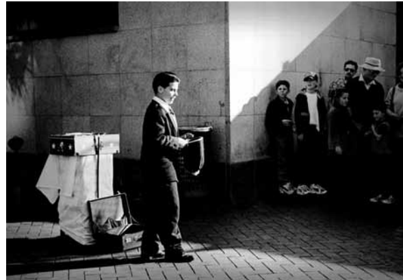
Young magician - Circular Quay

Supported by the ACT and Commonwealth Governments