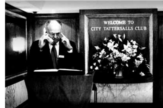
City Tattersall's Club - Sydney