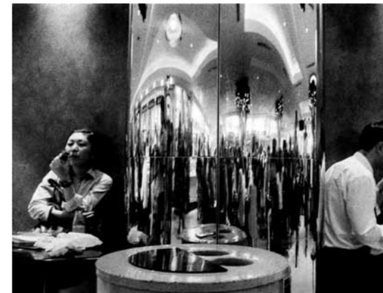
Mall off Pitt Street