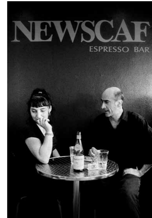
Espresso bar - Newtown