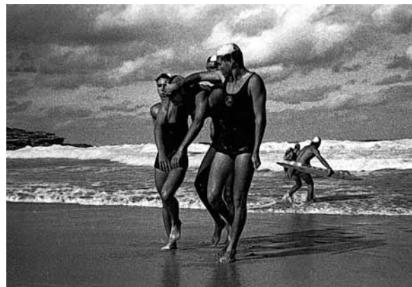
Beach - Sydney