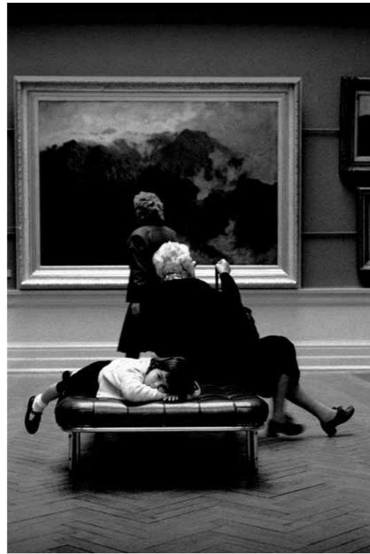
Tired – Art Gallery of New South Wales