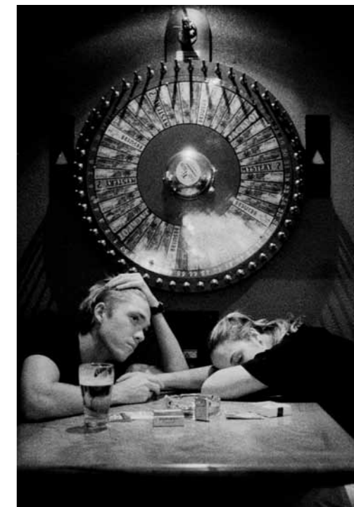
Long night – Sydney tavern