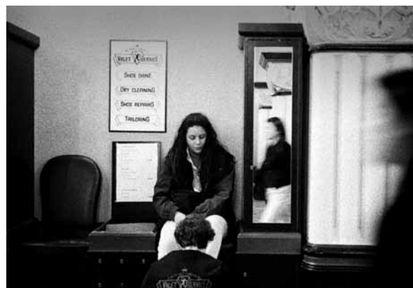
Shoe shine - Victoria House