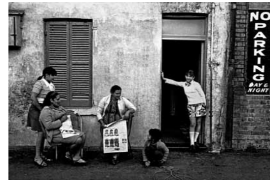
Family – Old Sydney