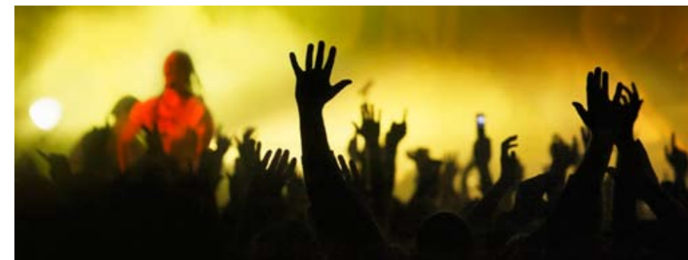
Michael Franti & Spearhead, 2006

Hopefully the images resonate with you, regardless of your age or musical taste, and rekindle fond memories of your own live music experiences. Enjoy!