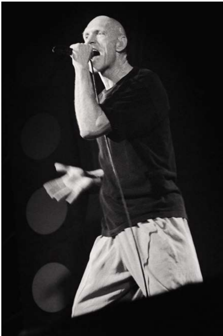
Peter Garrett, Midnight Oil , 1998