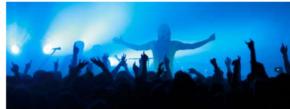
Michael Franti & Spearhead, 2006