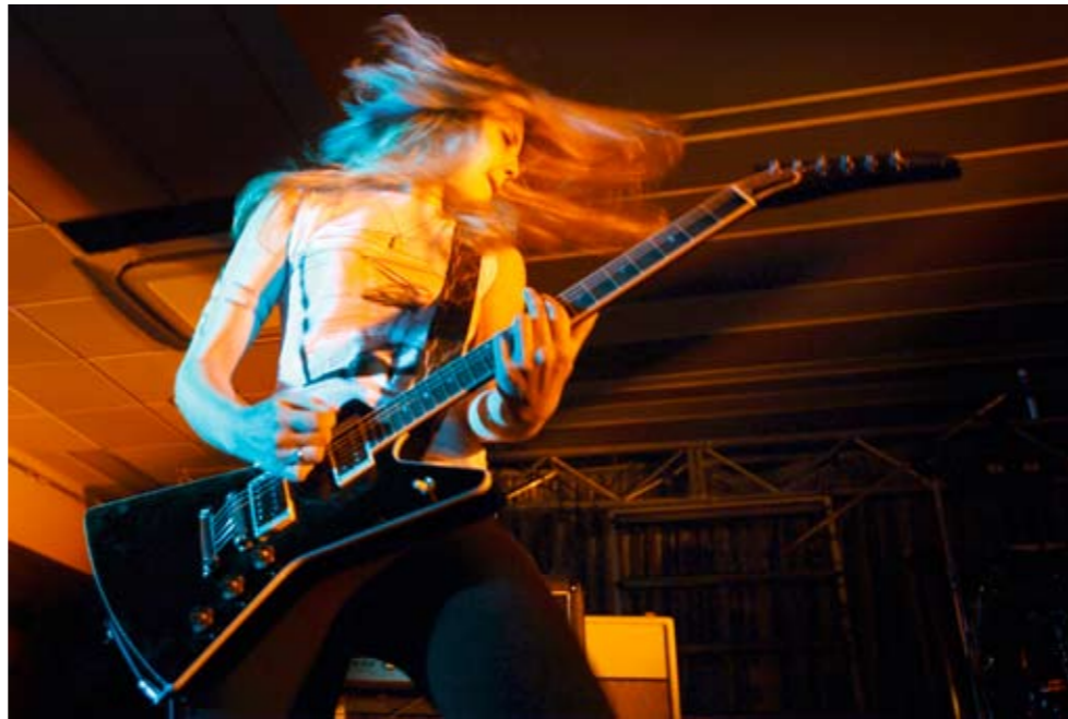
Allison Robertson, The Donnas , 2008 Cover Image: Daniel Johns, Silverchair , 2007