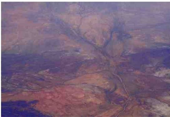
Arabana Country, SA