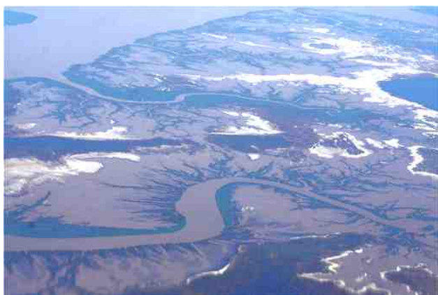
Kadgerong Country, WA