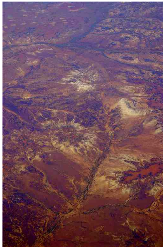
Painted Desert 2