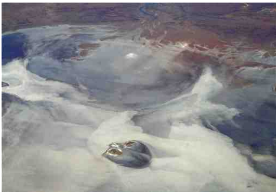
Adnamathana Country, SA