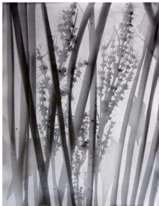
Birds in the Bush 2