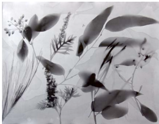
From the Bush