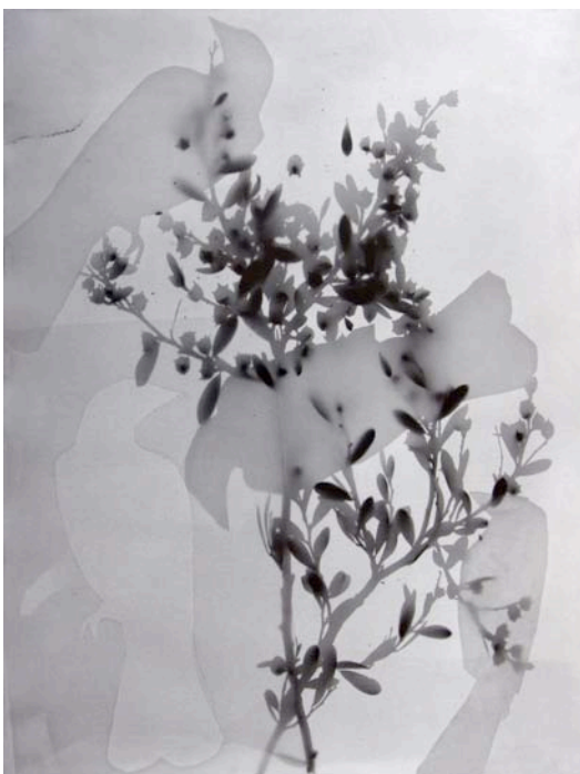
Birds in the Bush 1