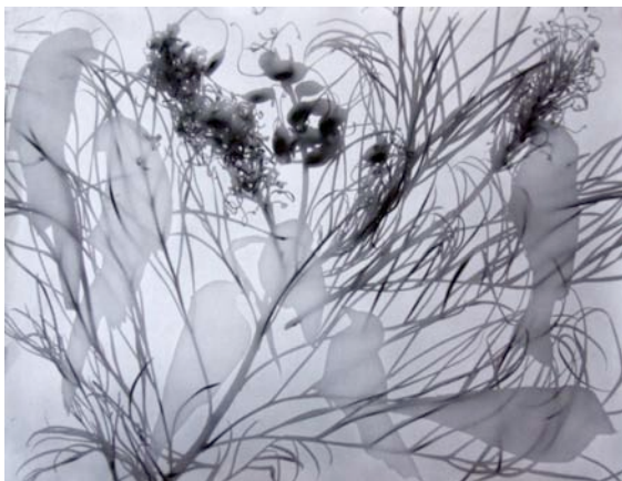
Birds in the Bush 4