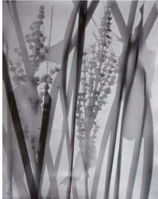
Birds in the bush 3