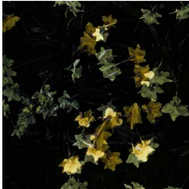
Untitled 1, Katherine Pepper

I rarely go out to take photographs, but I like to always have a camera with me. I'm kind of lazy, and I often seem to get more satisfying pictures when I'm not out intentionally seeking them. It's lovely feeling so relaxed about the whole thing, compared to when my income, my self-esteem and my reputation all seemed to depend on getting the shot. As well as being lazy, I'm also a little mischievous. I'm not sure that stealing photographs of people in the street without their awareness or permission is actually defensible, but I'd like to hear what you think. Use the feedback form on the site to let me know