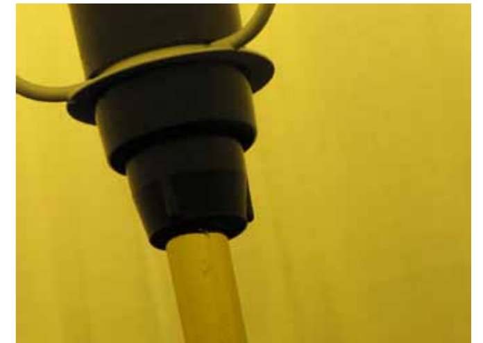
Lamp 1, David Chalker

I took my first photographs in the 1950s with a Kodak Box Brownie. I've always had a camera. Looking back over the boxes of prints and negatives and publications containing my images I recall the frustration and interminable time that came with film based photography. With digital capture and processing I feel free and in control. I can just play about if I want, print if I want, and I can scan old negatives or slides to make better images without having to spend hours in a smelly darkroom. Since I became involved with PhotoAccess in 2003 I have become more adventurous and, I hope, better at making images—like so many adults and kids who come to us to learn about photography or to exhibit their work. I've still got my oil and watercolour boxes, the paints are drying out and I'm not sure my beautiful easel will ever be other than a prop to contemplate and evaluate new prints. There's a box somewhere containing some very good SLRs. It may never be found. My new best friend is Stephen Best from Macquarie Editions who makes beautiful inkjet prints for me and nearly everyone I know.