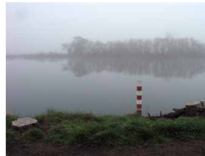
Close 1, Denise Ferris