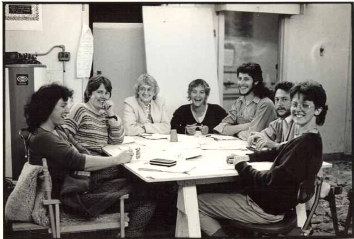
a meeting amongst the rubble