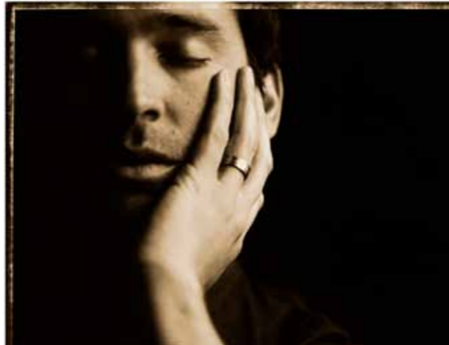
Untitled, Lindi Holly

Nicole ; pigment inkjet print on cotton rag paper; 57 x 48.5 cm (overall)