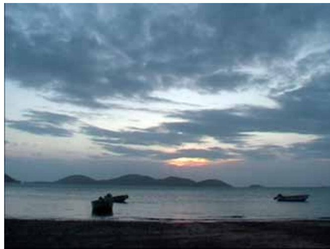
16 minutes on Bach Beach TI , Bronwyn Jewell

Bach Beach TI is a play on the concept of the post card; an ode to the relentless and oblivious being of nature; and the curiosity and expectation a fixed framed film creates—what's excluded what will happen next? In this moment, and within the same vicinity, a wedding procession went by in a blast of horns, a flock of cockatoos screeched through the sky without entering the shot and a man and his dog walked along the beach, curious but not interested enough to stop and ask. A fish broke the surface as if to check out the scene but didn't return. The sun still set behind the clouds, and without much fanfare, as the tethered boats bobbed about beneath on the rising tide.