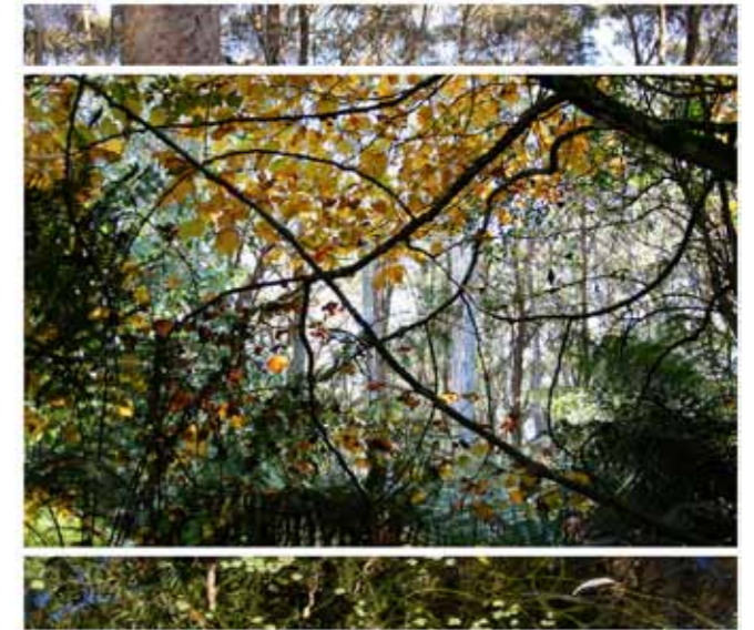
Almost Over the Edge, Alison Sexton-Green

Almost Over the Edge ; inkjet print on Arches Velin Museum Rag, 42 X 73.5 cm (overall)