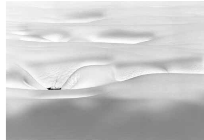
Halcyon Day, Joe Cali

Halcyon Day , 1996; silver gelatin print; 43 x 53 cm (overall)