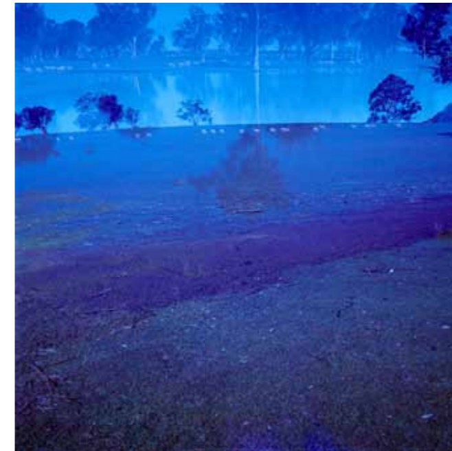
re-vision 1, Sharon Swincer

It has been a privilege to see PhotoAccess progress as the envisioned 'serious arts centre' it deserves to be. These images were taken on the Horizons course field trip I ran for PhotoAccess. Using an old Rolleiflex I gleefully ran from my focused commercial training to concentrate on a more unfocused view and revelled in the slow 'click' of the camera. The content of these individual shots was chosen, the juxtaposition of their multiple exposures less so, allowing an oblique and revised camera's view of man's impact on the landscape to emerge.