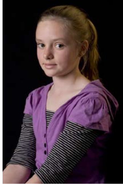
The Girl With The Gold Ear Ring , Robert Burne