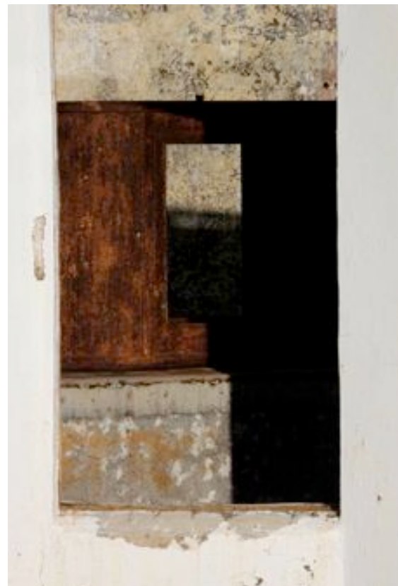
Ian Baird, Melbourne Telescope Observatory, Mt Stromlo I