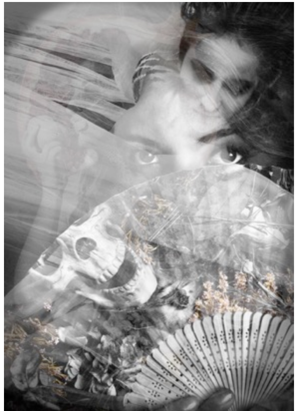
The Death's Maiden 3 and 4 2015, mixed media (inkjet prints on washi paper, layered with lightbox), 42cm x 59.4cm