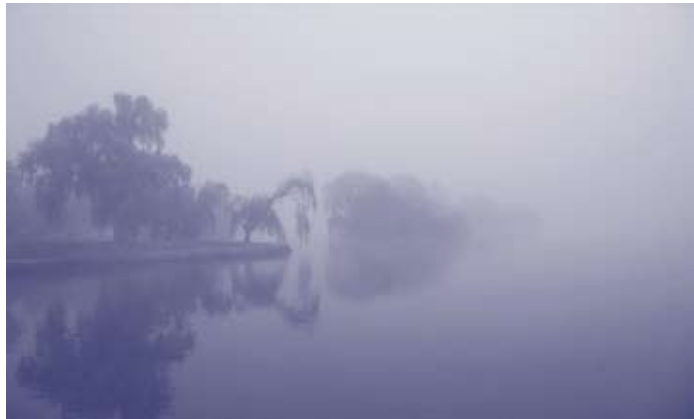
Aspen is in fog

Supported by the ACT and Commonwealth Governments