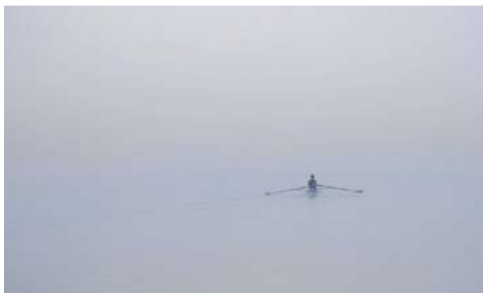
Wild blue yonder