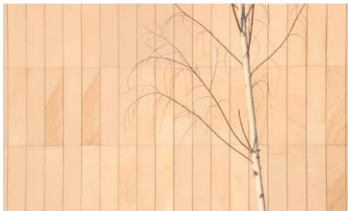
Against the wall