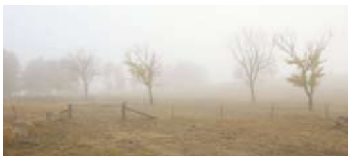
North Curtin horse paddock