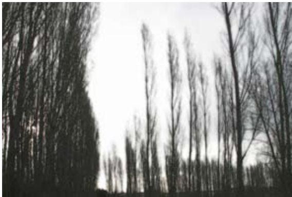
Looking for the way home