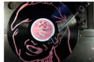
Video Stills 2007