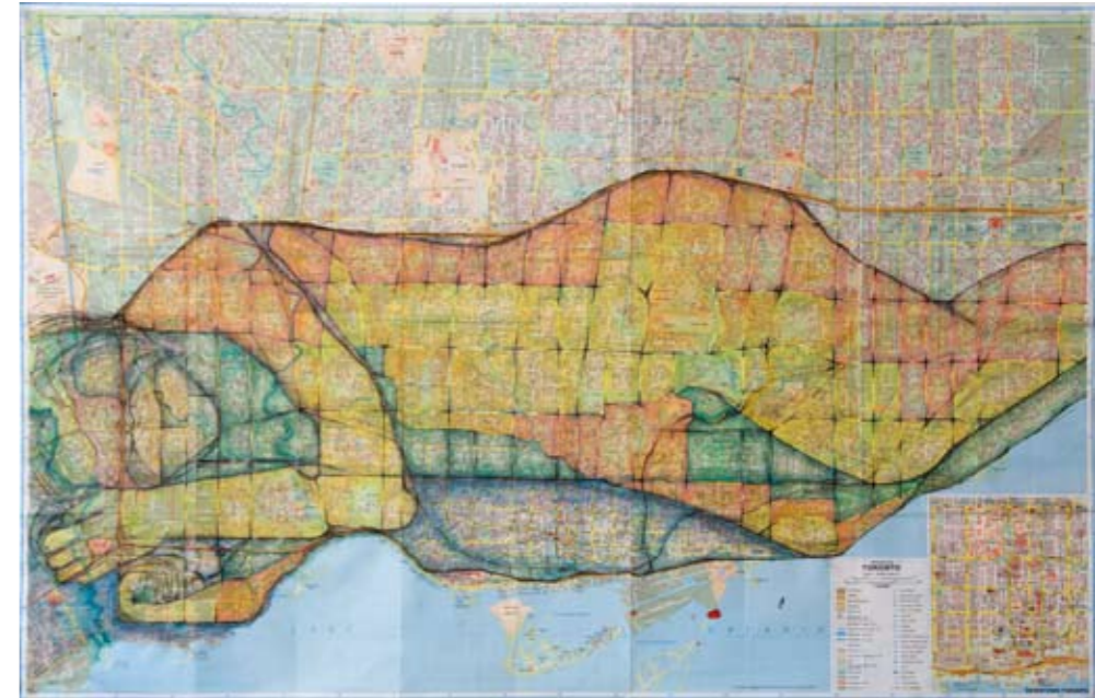
Sleeping City 2008