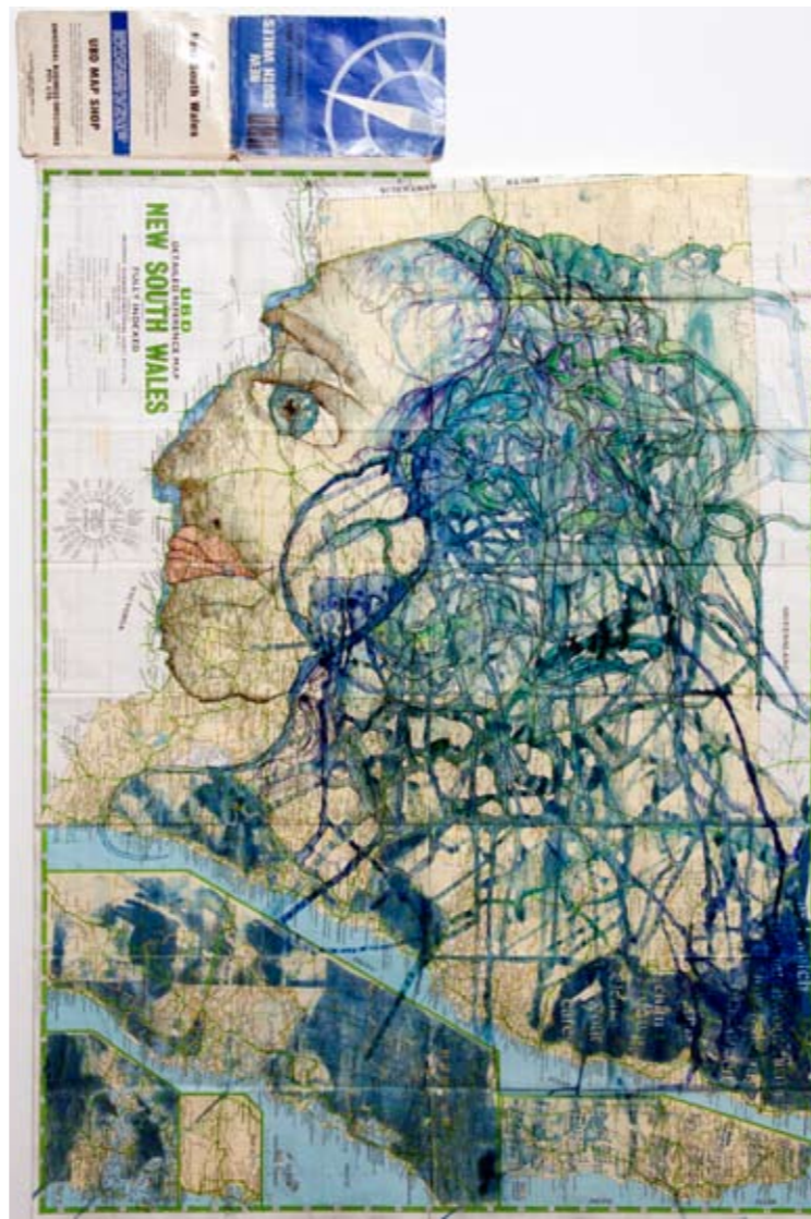
As I watch 2008