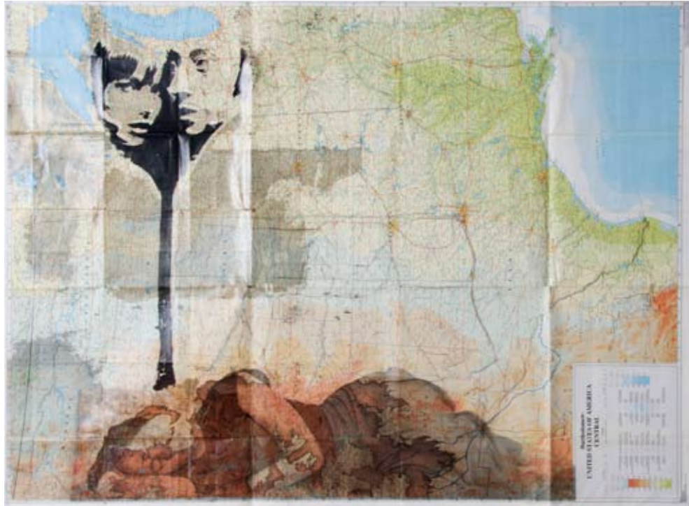
American Dream 2008