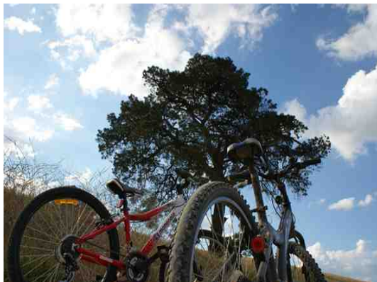
Nic Radoll, Bike 2