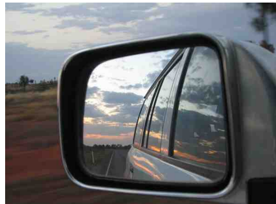
Nic Radoll, Sunset 5

A 15 year old HSC student, Nic started taking photographs about two years ago. He began by experimenting with light and fast moving objects and, enthused by the results, he decided to learn more about photography by attending the PhotoAccess course. He is inspired by nature, including rock formations, landscapes, weather, and human impacts on nature.