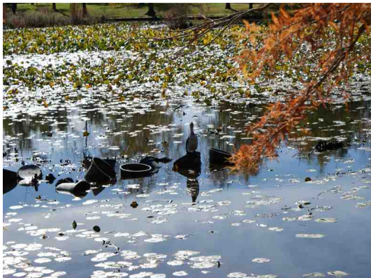
Nic Radoll, Pond 3