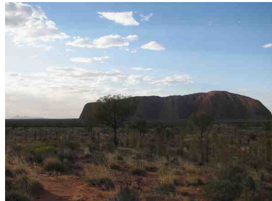
Nic Radoll, Sunset 1